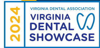
Exhibit Hall Map COMING SOON