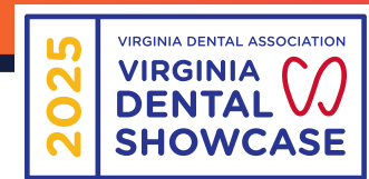
Exhibit booths will be assigned in accordance with the exhibitor's preference in the order in which completed agreements are received with the correct deposit. VDA cannot guarantee that booth space requested will be granted. Also taken into consideration are competing companies if noted on the application. Shielding cannot be guaranteed.